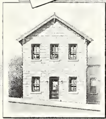
MARK TWAIN STATUE IN RIVERVIEW PARK MARK TWAIN AND HIS BOYHOOD HOME TOM SAWYER AND HUCK FINN STATUE ENTRANCE TO MARK TWAIN CAVE MARK TWAIN MUSEUM